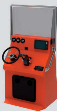
Centre console S-700 PRO L: 76cm - W: 100cm - H: 182cm