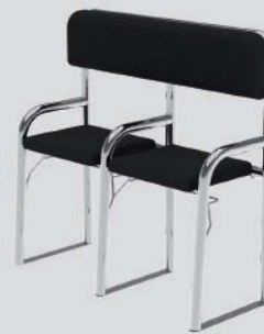
Folding seat 2 people L: 105cm - W: 430cm - H: 104cm