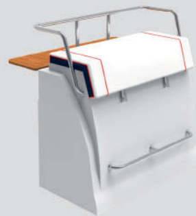
Modular backrest Seat S-700 F L: 54cm - W: 110cm - H: 101cm