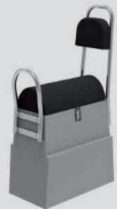
Modular seat 1 person L: 62cm - W: 32cm - H: 107cm