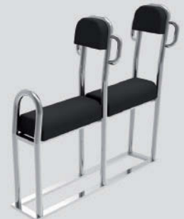
Modular seat 2 people L: 124cm - W: 37cm - H: 113cm