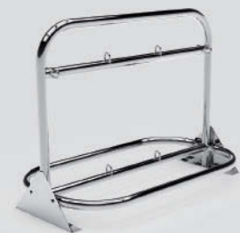
Bottle rack 6 units L: 103cm - W: 58cm - H: 76cm