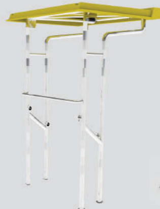
T-top with GRP fabric cover L: 145cm - W: 121cm - H: 215cm