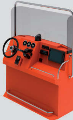
Centre console S-800 PRO L: 55cm - W: 143cm - H: 177cm