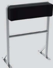
Backrest 2 people deck L: 50cm - W: 91cm - H: 120cm