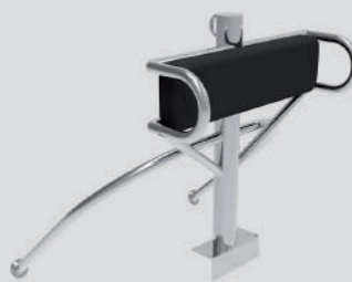
Backrest with tow bar L: 146cm - W: 142cm - H: 130cm