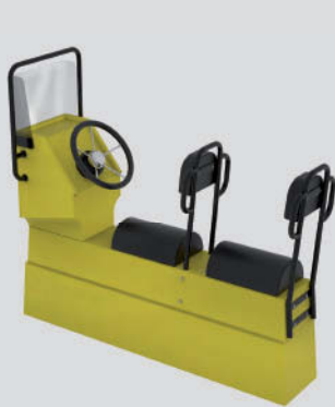
Jockey console 2 people L: 159cm - W: 50cm - H: 141cm