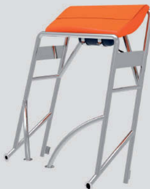
Navigation frame with self righting system L: 131cm - W: 106cm - H: 163cm