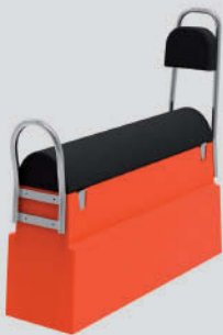
Modular seat double L: 112cm - W: 32cm - H: 105cm