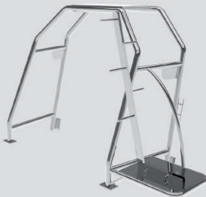
Navigation frame S-700 with ladder L: 108cm - W: 241cm - H: 155cm